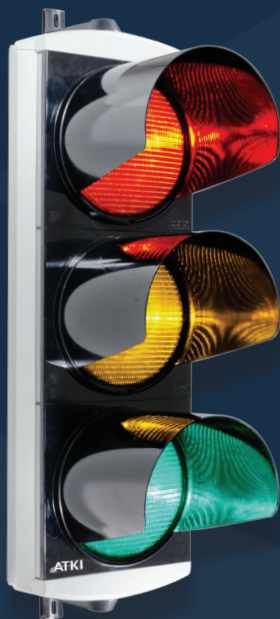
MARTIN SYLVESTER CONSULTANT | ATKI

Black (RAL 9005) Green (RAL 6009) Gray (RAL 7035)